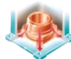
Smooth and direct transition of forces to the mounting feet.

As a component of the mixer design, the gear unit performs several functions. In addition to reducing speed and increase torque, it must also provide support for mixer shaft and impeller and the associated mixer forces. This means that the gear unit cannot be selected on the basis of the output torque alone. Bearing loads and shaft deflections resulting from the mixer action are in addition to those already present from the torsional loads. Gear housing design, low speed shaft and bearings are therefore rated to carry large bending moments and thrust loads imposed by the mixing forces. Different executions for mounting and centring of the drive group on the mixer tank are possible.