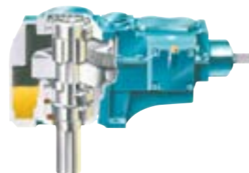
A powerful combination of a spherical roller bearing with tapered roller bearings provides extremely high thrust load and bending moment capacity.